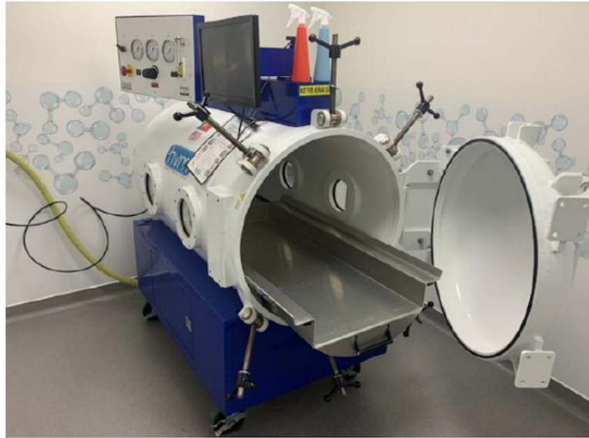
Fig. 2. Hyperbaric chamber model (Photograph kindly provided by CR 2 AL).

during the therapeutic process, followed by the treatment itself. In the final phase, the decompression was carried out, which lasted 20–25 minutes. This protocol was adjusted according to the daily clinical exam.