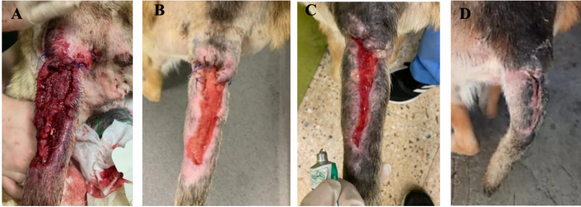
Fig. 4. Evolution of wound at the base of the tail from MVS_{T_0} to MVS_{T_4} . (A) Wound upon admission with MVS_{T_0} > 15 . (B) Wound after surgical management (cleaning of necrotic tissue and approximation of edges). (C) Wound after 5 HBOT sessions with MVS > 10 and \leq 15 . (D) Wound after 10 HBOT sessions with classification MVS_{T_4} > 5 and \leq 10 .